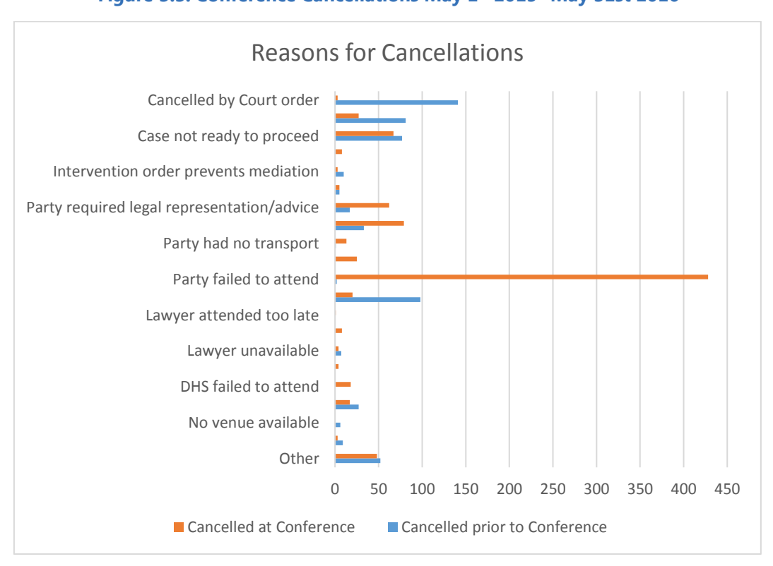
Figure 3.3: Conference Cancellations May 1st 2015- May 31st 2016

The Families Survey demonstrated that travelling to conferences can take a considerable amount of time. For example, 40% of families indicated they travelled for over two hours in order to arrive on time. <sup>10</sup> In addition, some (43%) had made special arrangements, that included childcare and time off work. Non-attendance by any party is therefore a critical issue when complex arrangements have been made to enable some people to attend.