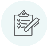
Total Matters Listed