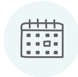
Average Per Day